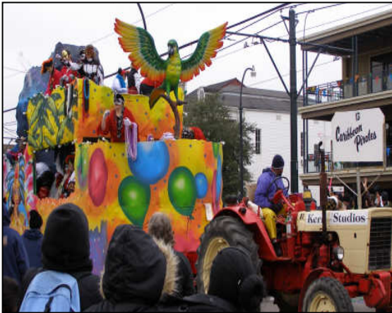
"Krewe of Shangri La" Mardi Gras 2008

Comus coined the word "krewes" and established several Mardi Gras traditions by forming a secret Carnival society, choosing a mythological namesake, presenting a themed parade with floats and costumed maskers, and staging a formal ball. A visit by Russian Grand Duke Alexis Romanoff was one inspiration for the first appearance of Rex (The King of Carnival) in 1872, who immediately became the international symbol of Mardi Gras. Next year ask your parents if they will take you to Mardi Gras. It's a great holiday.